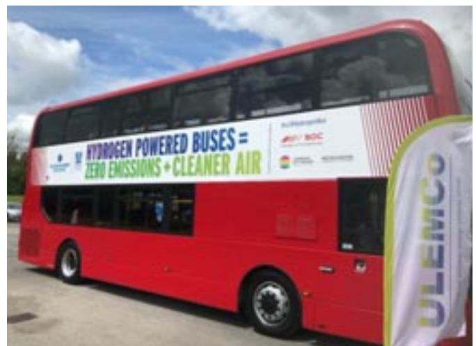
Hydrogen-powered bus - For a hydrogen economy, for example for use in hydrogen powered-buses, we will need to be able to store large amounts of hydrogen in salt layers.

There is also potential for geothermal energy to play a significant role in decarbonising heating in the UK with the added potential for electricity generation. Low temperature geothermal energy in particular, typically groundwater with a temperature less than 20°C, can play a part in decarbonising heating. Huge volumes of such waters exist under the UK’s towns and cities. Former industrial areas where waters move very freely because of old coal mine workings may be