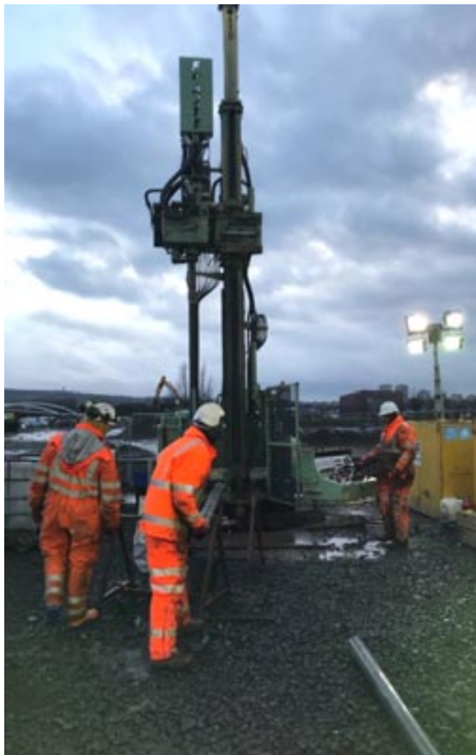
Drilling an observatory in Glasgow to study heat in flooded mineworkings. © Mike Stephenson.

poverty, could also benefit from coal mine heat.